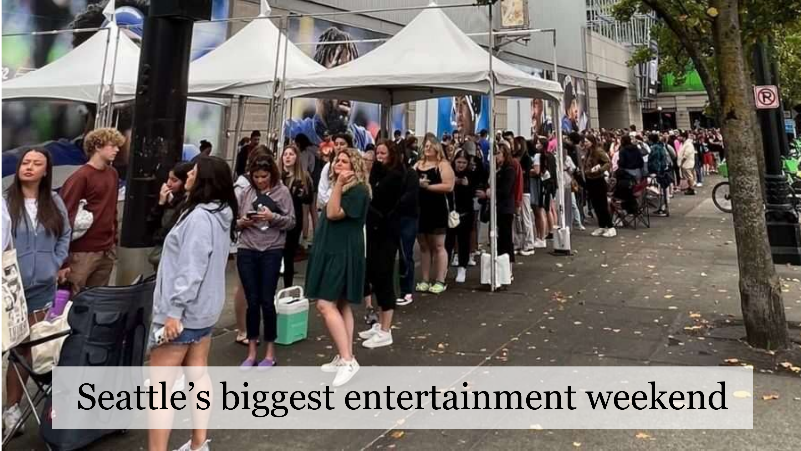
Seattle's biggest entertainment weekend